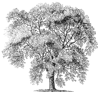
Quercus Süber, Cork Oak

The Alliance for Historic Landscape Preservation 82 Wall Street, Suite 1105 New York, NY 10005 USA www.ablp.org