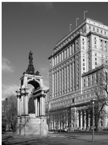
Sun Life Building, downtown Montreal

—Cari Goetcheus 864-656-6787 cgoetch@clemson.edu